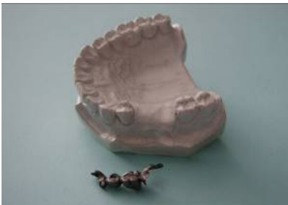
Fig. 1: Fixed partial bridge used for modelling.

METHODS: The fixed partial dental bridge (Fig. 1) was modelled using the MODELA device. This device is mechanical modeling one. The models were obtained in the wireframe mode and also in the render mode. The model was uploaded in PROENGINEER in order to definite the margins and the specifics zone for the bridge. After that the model was imported in ANSYS in order to perform the numerical simulation. We used titanium, all ceramic system, all polymeric system, Co-Cr alloy and gold as the materials for this bridge. It was perform another set of numerical investigations for the situation of different temperature (-10 °C and 50 °C).