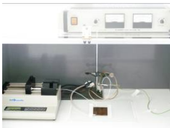
Fig. 1: Configuration of our Electrospinning apparatus.

METHODS: The apparatus used for electrospinning consists of a high voltage electric source with positive or negative polarity, a syringe pump with capillaries or tubes to carry the solution from the syringe to the capillary, and a conducting collector like aluminium (Figure 1). The final fibrous structure can be tailored by altering the concentration of the polymer solution, the molecular weight and molecular-weight distribution, the applied voltage, the solution flow rate and the distance between the capillary and collector. The effects of the preparation conditions on the fiber diameter were observed by optical microscopy and scanning electron microscopy (SEM).