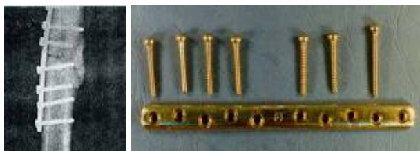
Fig. 1: Plate and screws of AISI 316L

The study of the electrochemical behaviour of biomedical materials in simulated body fluids was carried out using open circuit-potential, potentiodynamic polarization curves, potentiostatic measurements at different immersion times and electrochemical impedance spectroscopy (EIS).