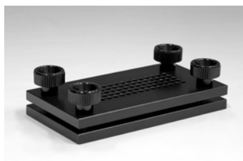
Fig. 1 Multi-well device

RESULTS: The designed multi-well device is able to perform simultaneously eighty adsorption experiments, each with a volume of 20µL (Fig. 1).